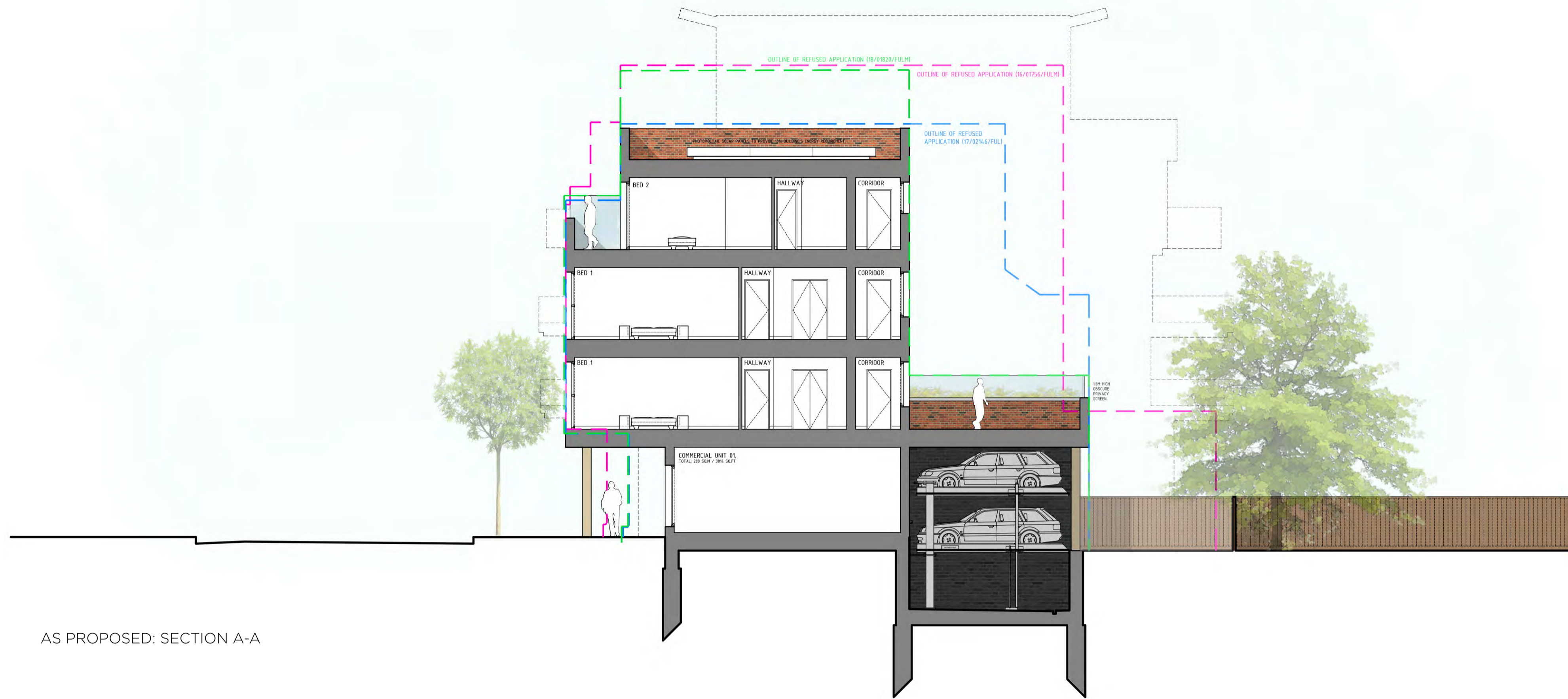
AS PROPOSED: SECTION A-A

GENERAL NOTES The copyright in all designs, drawings, schedules, specifications and any other documentation prepared by DAP Architecture Ltd. in relation to this project shall remain the property of DAP Architecture Ltd. and must not be reissued, loaned or copied without prior written consent. Do not scale from this drawing, use figured dimensions only. Prefer larger scale drawings. All dimensions are in millimeters (mm) unless otherwise noted. Check all relevant dimensions, lines and levels on site before proceeding with the work. This drawing is to be read in conjunction with all Architect's drawings, schedules and specifications, and all relevant consultants' and/or specialists' information relating to the project. Refer all discrepancies to DAP Architecture Ltd.